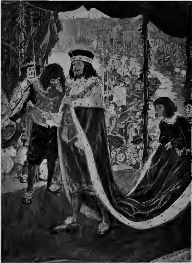
Charles I walking to his Coronation at Westminster W. Hatherell, R.I.